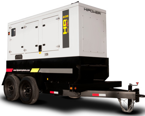
Photo depicts a typical model but may not include options such as trailer.