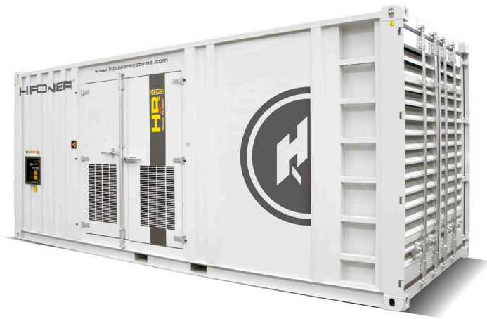
Photo depicts a typical model but may not include options such as trailer.