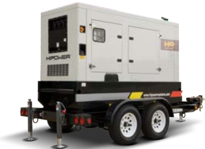
Photo depicts a typical model but may not include options such as trailer.