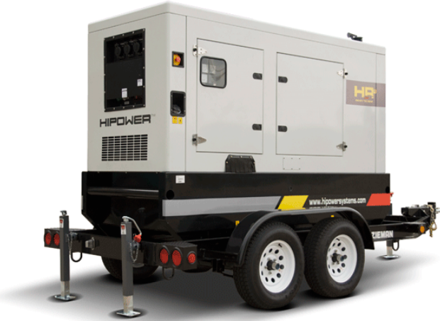
Photo depicts a typical model but may not include options such as trailer.

Standby - Applicable for a varying emergency load for the duration of a utility power outage with no overload capability.