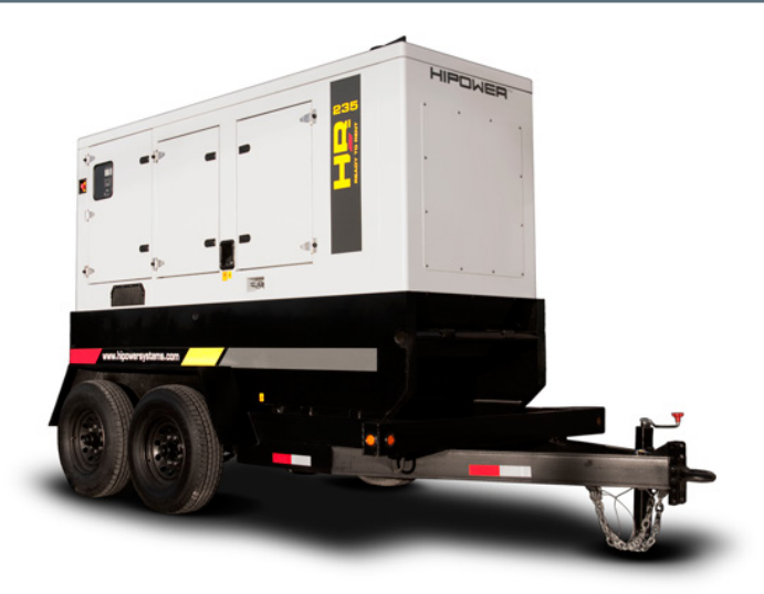
Photo depicts a typical model but may not include options such as trailer.