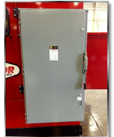
NEMA 3R Disconnect Box