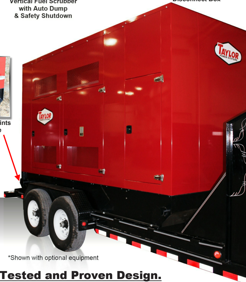
*Shown with optional equipment