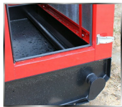
Teardrop Lifting Points extend full frame