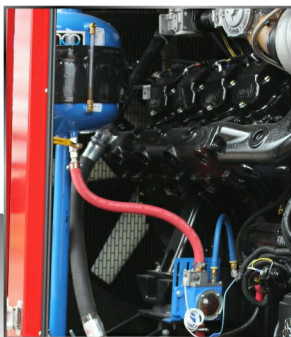
5 to 16 gallon oil reservoir with site glass regulator