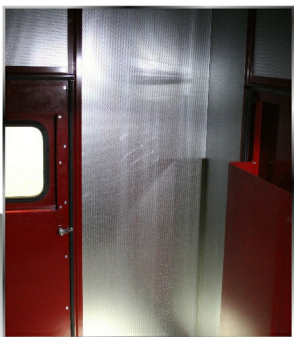
2" thick Roxul wool Insulation with Galvanneal perf liner