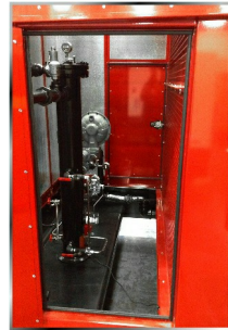
Vertical Fuel Scrubber with Auto Dump & Safety Shutdown