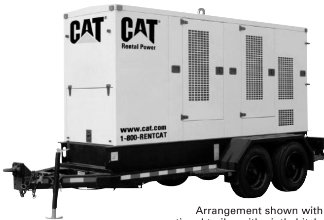
Arrangement shown with optional trailer with pintle hitch.