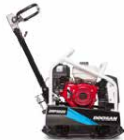
DRP 2316 | DRP 3220 | DRP 4924