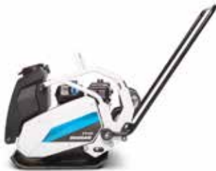
DFP 1013 | DFP 1516 | DFP 1520