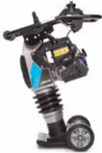
DRX 60 | DRX 70

Charged with industry-leading impact forces