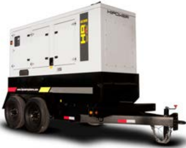
Photo depicts a typical model but may not include options such as trailer.