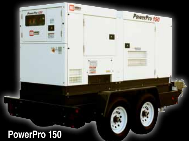
PowerPro 150 150 kVA Prime Power Tier 3 Flex Isuzu Diesel Engine