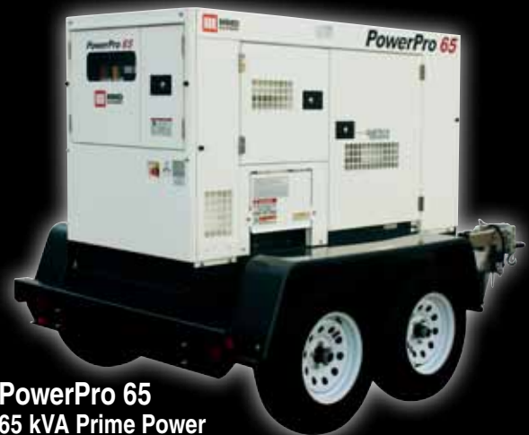
PowerPro 65 65 kVA Prime Power Interim Tier 4 Kubota Diesel Engine